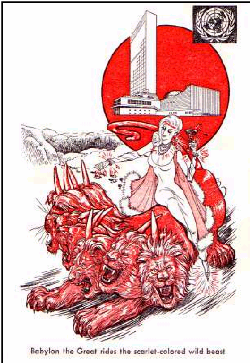
Babylon the Great rides the scarlet-colored wild beast

“Babylon the Great has Fallen— God’s Kingdom Rules” 1963 page 577 Copyright, Watch Tower Bible and Tract Society of Pennsylvania