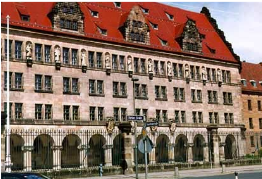
The Nuremburg Courthouse.

We appeal with heartfelt Christian love to all of Jehovah's Witnesses who follow the Governing Body to look carefully at the following seven counts and to also look to their own consciences. Elders who have oversight in their congregations should particularly realise that, "I was only obeying orders" is not a justifiable defence. This principle was established at The Nuremburg Trials. However, with great respect to the courts of this world, you will see that this is a moral Indictment and is served in the presence of a 'higher court.' (Ecclesiastes 5: 8)